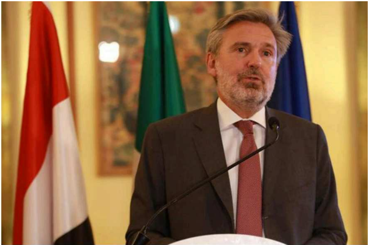
Ambassador of Italy to Egypt Michele Quaroni.

Renowned Italian artist and Arte Povera pioneer Michelangelo Pistoletto will headline the fifth edition of Forever Is Now, Egypt's leading international contemporary art exhibition held against the backdrop of the Pyramids of Giza.